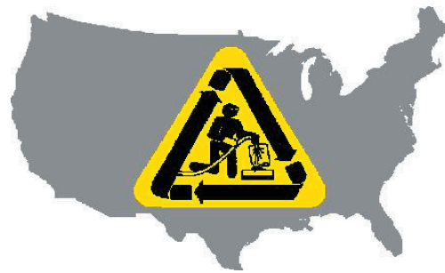
USAg Recycling, Inc.